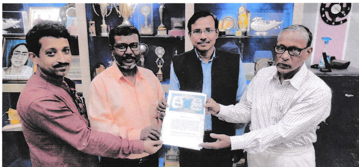
MoU signed at Bajkul Milani Mahavidyalaya by the authority (Principal & President) of Swarnamoyee Jogindranath Mahavidyalaya and (Teacher-in-Charge & Bursar) of Bajkul Milani Mahavidyalaya