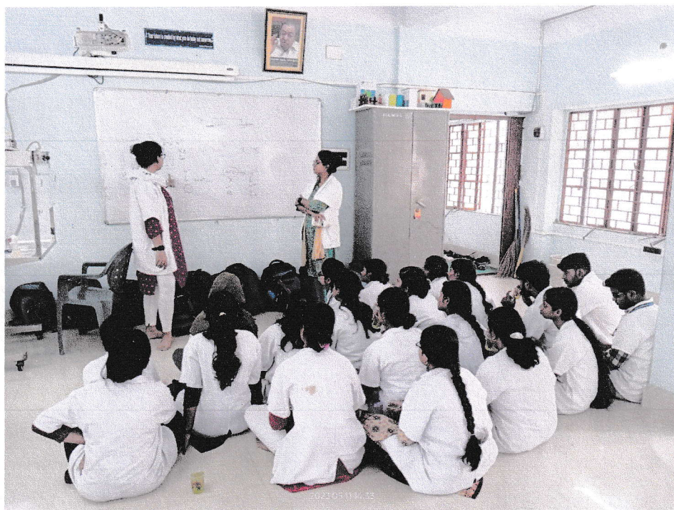
Student Exchange Programme: Practical Lab Visit as per university curriculum at Dept. of Nutrition, Mugberia Gangadhar Mahavidyalaya

P.O.- Kismat Bajkul • Dist.- Purba Medinipur • Pin Code No.- 721655 E-mail : bajkulcollege@bajkulcollege.org • bajkul_college@rediffmail.com Web : www.bajkulcollege.org