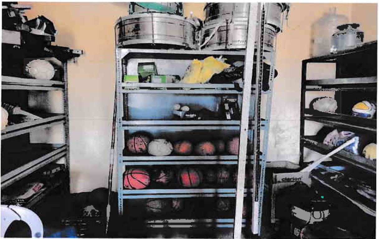
Sport equipments of Bajkul Milani Mahavidyalaya

ATTESTED [Signature] 21/08/2023 Teacher-in-charge Bajkul Milani Mahavidyalaya P.O.- Kismat Bajkul Dist.- Purba Medinipur