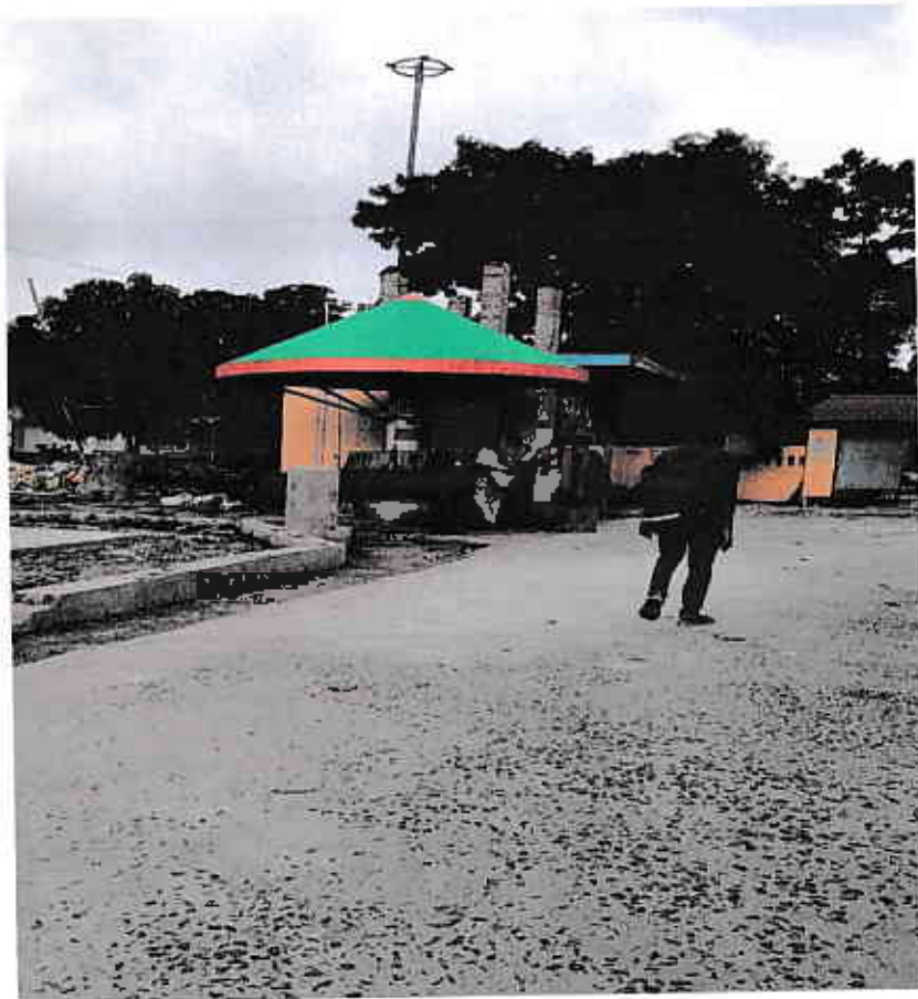
Purified water supply for all of Bajkul Milani Mahavidyalaya