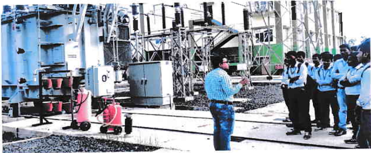
Bajkul Milani Mahavidyalaya Private ITI, Industrial visit to Kolaghat Thermal Power Plant.