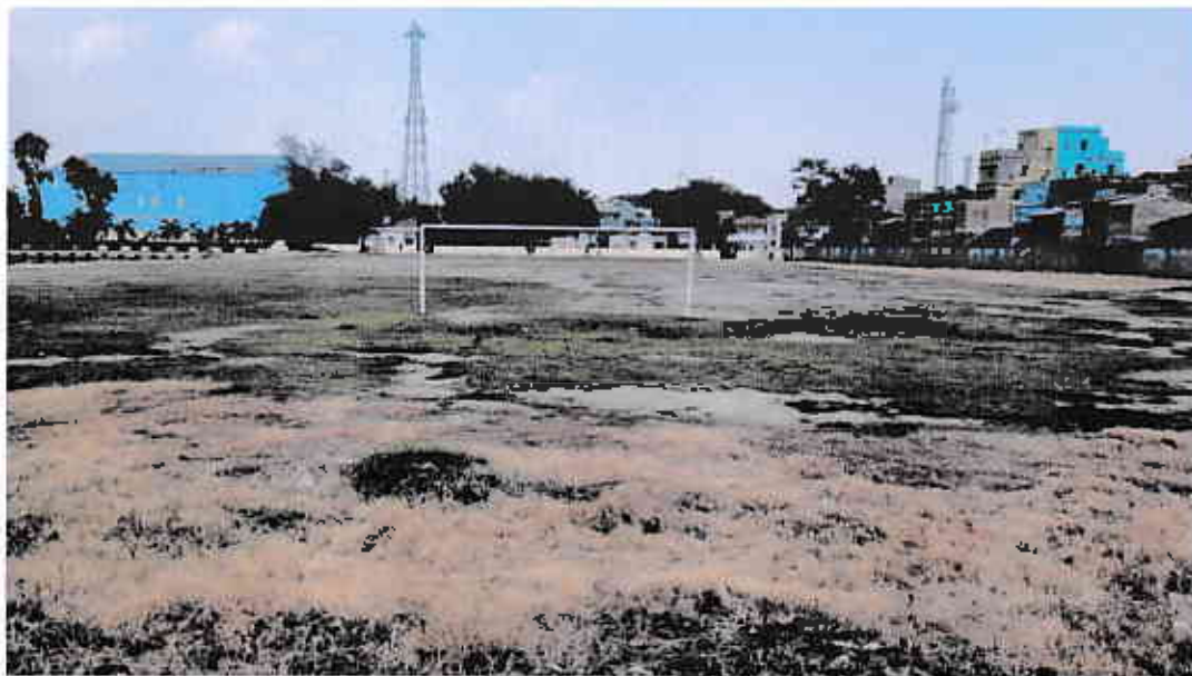
Play ground of Bajkul Milani Mahavidyalaya