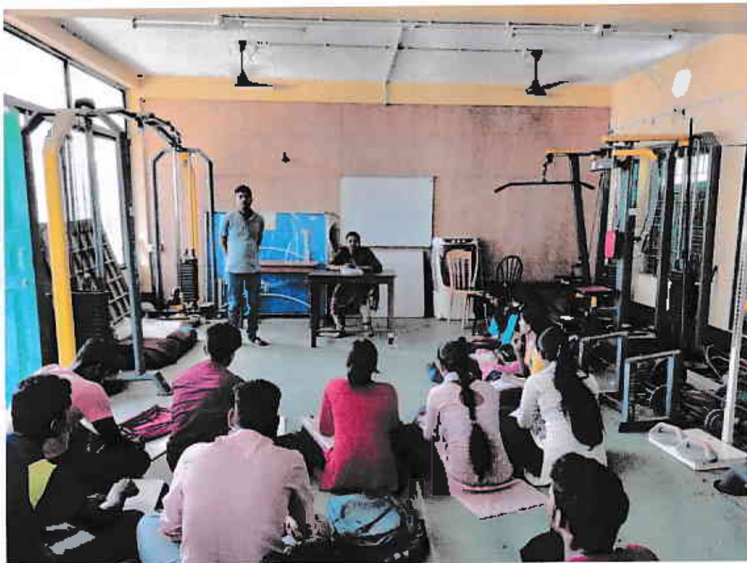
Modern gymnasium of Bajkul Milani Mahavidyalaya