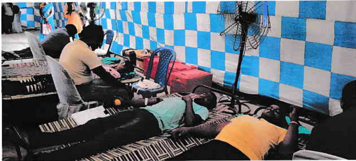
Blood donation in camp organized by Bajkul Milani Mahavidyalaya in collaboration with Bajkul United Forum

College organizes blood donation camp every year in collaboration with local welfare organizations, Alumni Association, Contain Blood Bank and Bhagwanpur Health Centre. Large numbers of students, staff and local area people participate and donate blood in the camp. IQAC takes important part in these camps. Each time tree plantation program is associated with the blood donation camp. In the last five years as per record the camps were conducted with grand success.