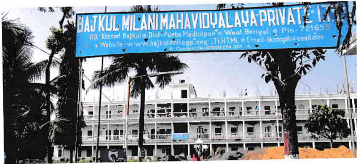
Bajkul Milani Mahavidyalaya Private ITI, Bajkul College Campus