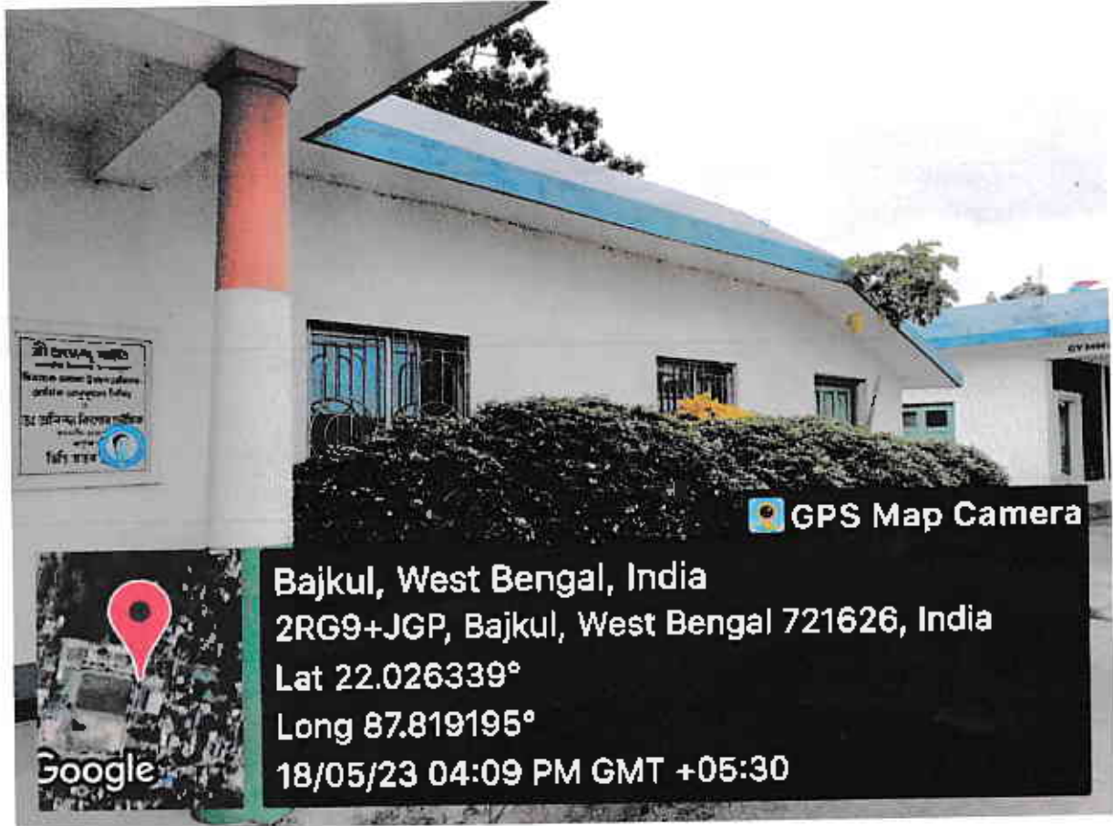
College canteen of Bajkul Milani Mahavidyalaya

P.O. : Kismat Bajkul ● Dist. : Purba Medinipur ● Pin Code No.- 721655 Fax : 03220-274-291, Web : www.bajkulcollege.org E-mail : bajkul_college@rediffmail.com