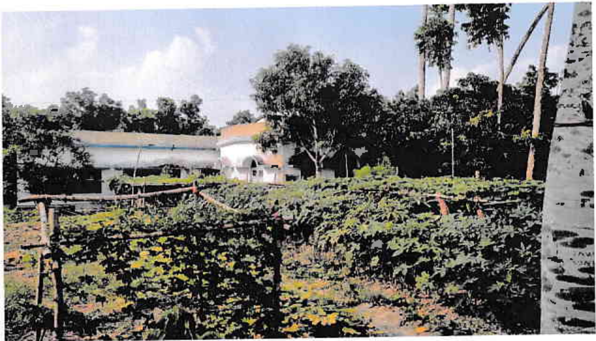
Kitchen Garden In front of Girls' Hostel of Bajkul Milani Mahavidyalaya