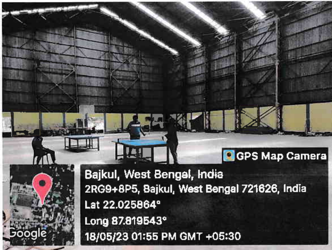
Indoor sport complex of of Bajkul Milani Mahavidyalaya

ATTESTED [Signature] 21/08/2023 Teacher-In-charge Bajkul Milani Mahavidyalaya P.O.- Kismat Bajkul Dist.- Purba Medinipur