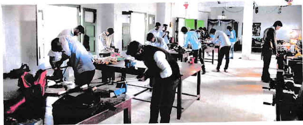
Bajkul Milani Mahavidyalaya Private ITI, Practical Class

ATTESTED [Signature] 21/08/2022 Teacher-in-charge Bajkul Milani Mahavidyalaya P.O.- Kismat Bajkul Dist.- Purba Medinipur