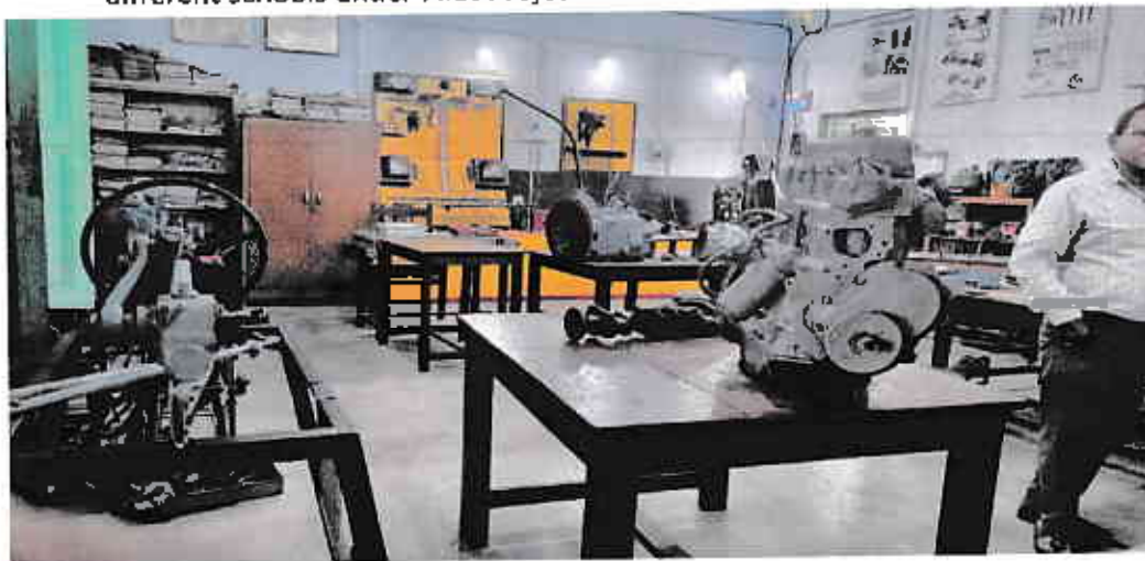
Bajkul Milani Mahavidyalaya, practical room of Automobile Maintenance Department.

This is the only major course in the subject Automobile Maintenance under the Vidyasagar University since []. Intake capacity is 66. Students from this subject are provided with campus facilities every year. Students get jobs in different automobile companies like Ashok Layland, Mahindra and Mahindra, Bhandari Automobile etc. a large numbers of students from this subject are engaged as trainers in automobile vocational subject in different Schools under Pilot Project of Govt. of India.