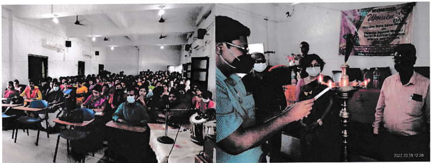
Women's day Celebration

ATTESTED (Signature) 22/08/2023 Teacher-in-charge Bajkul Milani Mahavidyalaya P.O.- Kismat Bajkul Purba Medinipur