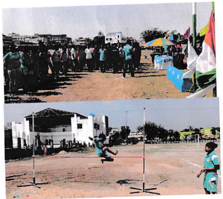
Girls performing sport event in college sport

ATTESTED Chs. [Signature] 22/08/2019 Teacher-in-charge Bajkul Milani Mahavidyalaya P.O.- Kismat Bajkul Purba Medinipur