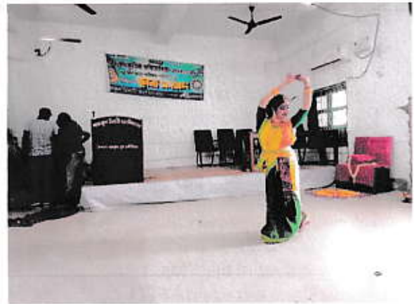
Girls performing cultural event of college

ATTESTED Mr. [Signature] 22/08/22 Teacher-in-charge Bajkul Milani Mahavidyalaya P.O.- Kismat Bajkul Dist.- Purba Medinipur