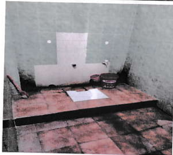
Sample photo of ladies toilet

ATTESTED (Signature) Teacher-in-charge Bajkul Milani Mahavidyalaya P.O.- Kismat Bajkul Dist.- Purba Medinipur