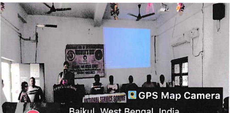
Bajkul, West Bengal, India