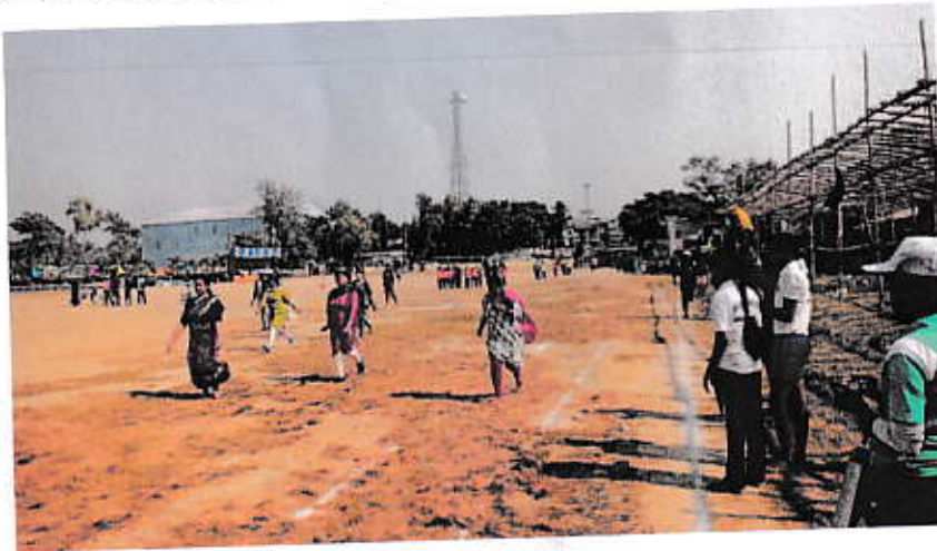
Women employees participating in college sport

Each year a large number of girl students participate in college sports and cultural events. Women employees also take part in sport events.